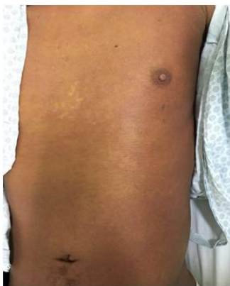
Figure 1: Thoracic and abdominal morbilliform maculopapular rash.