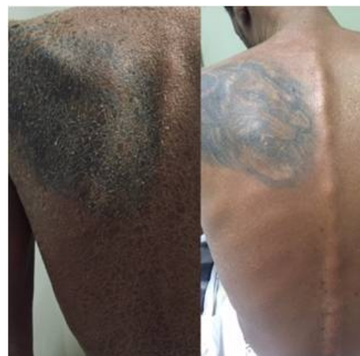
Figure 4: Skin lesions on scaling in the resolution phase after removal of triggering medication and introduction of corticosteroids.